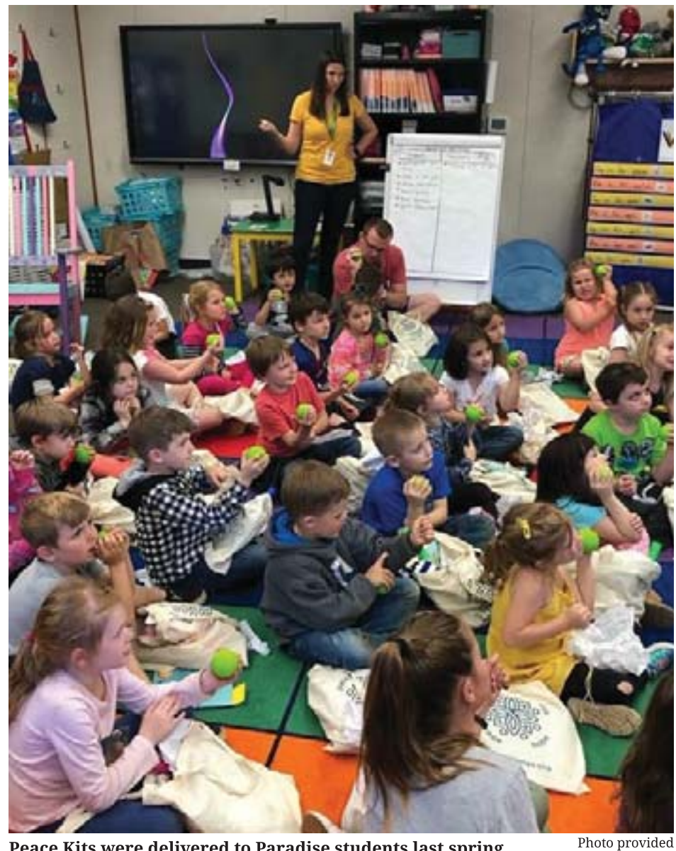
Peace Kits were delivered to Paradise students last spring.